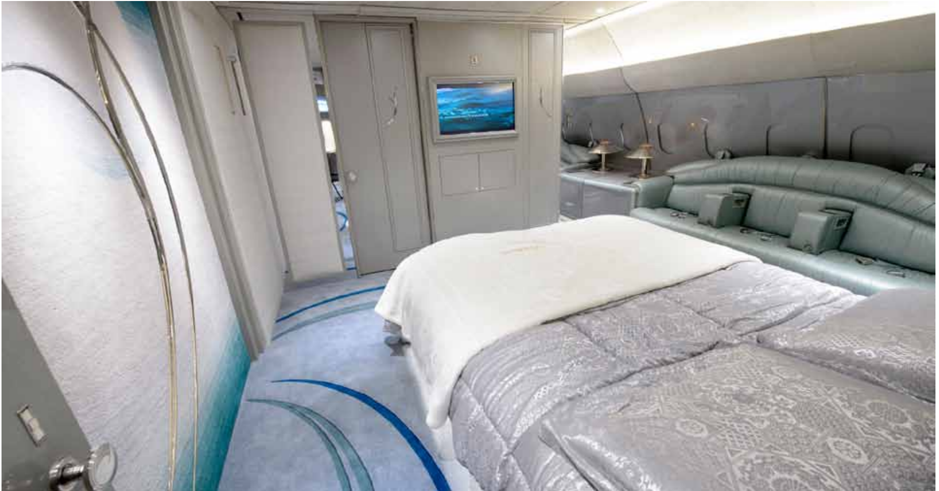
VIP Bedroom & Bathroom