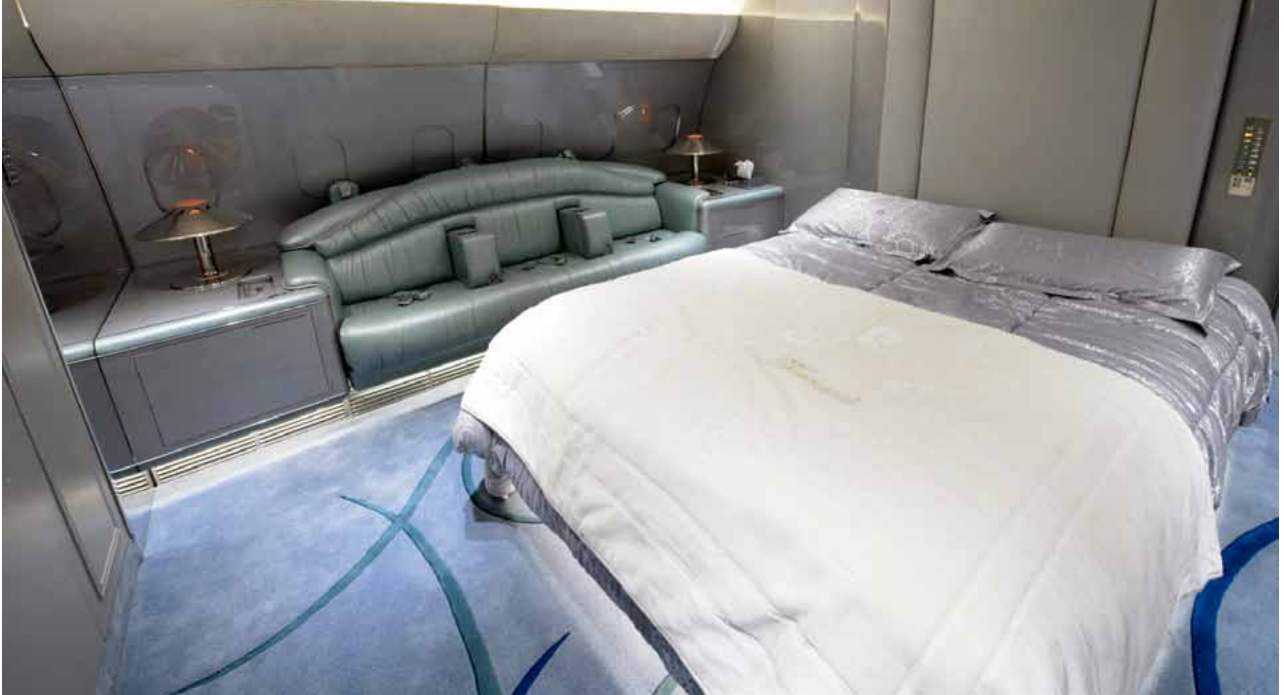
VIP Bed Room